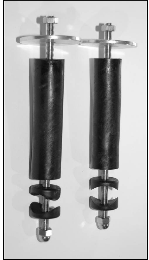
Stand Offs Assembled