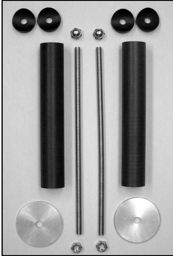
Stand Offs Broken Down