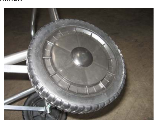
***Step 8: Tighten all fasteners on carrier.***

Place caps on wheels. Gently tap into place with hammer.