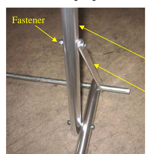
Upright Handle Tube

Insert bolts and finger tighten fasteners.