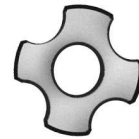
Silver, NOT Brass