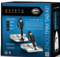
Retail Box See check-list below