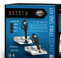
Retail Box See check-list below