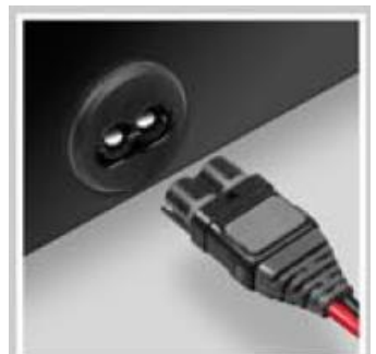
1-1/2" Round Hole Adaptor Included