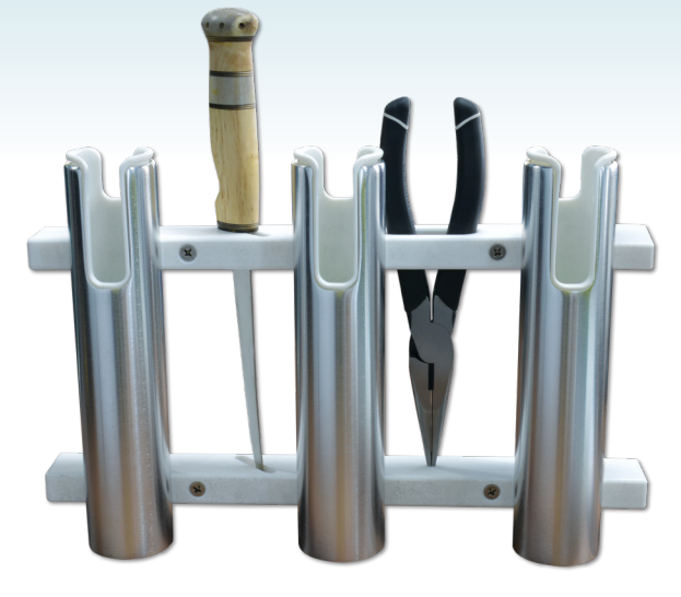
Tools and mounting hardware not included